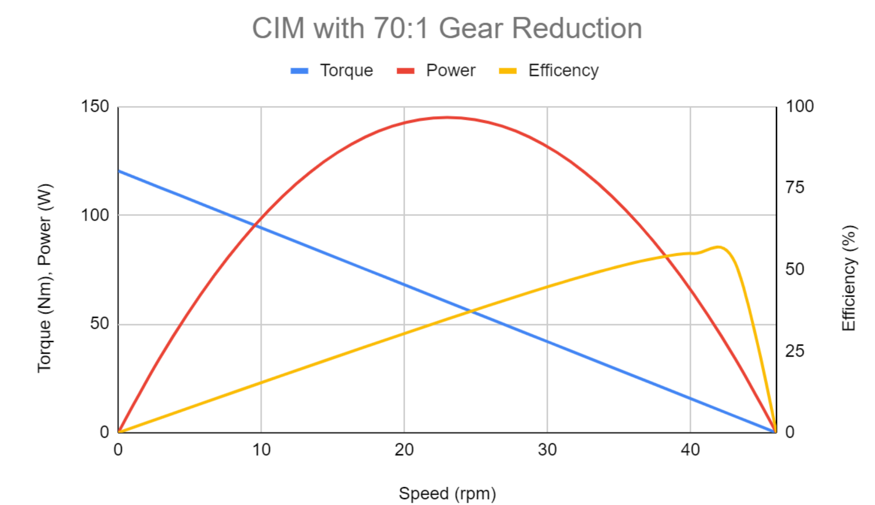
Figure 2: Calculated motor curve that will be used